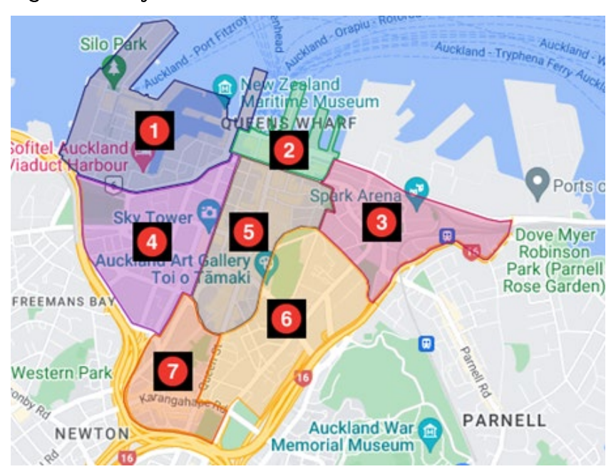
Figure 2: Study zones

The target population for this research was Aucklanders who live in one of the seven city centre zones. aged 65 years and over. The target sample was n= 800 responses.