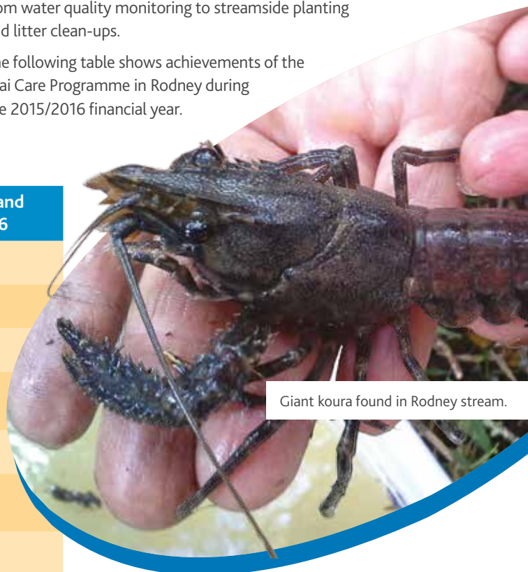
Giant koura found in Rodney stream.

For more information on Wai Care, or to view site data for your area, go to waicare.org.nz or call 09 301 0101 and ask for Wai Care.