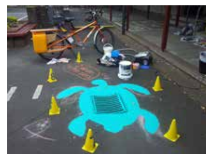
Photo: Drain painting at Richmond Road Primary School