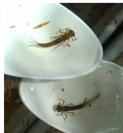
Photo: Damselfly larvae

For more information on Wai Care, or to view site data for your area, go to www.waicare.org.nz or call 09 3010101 and ask for Wai Care.