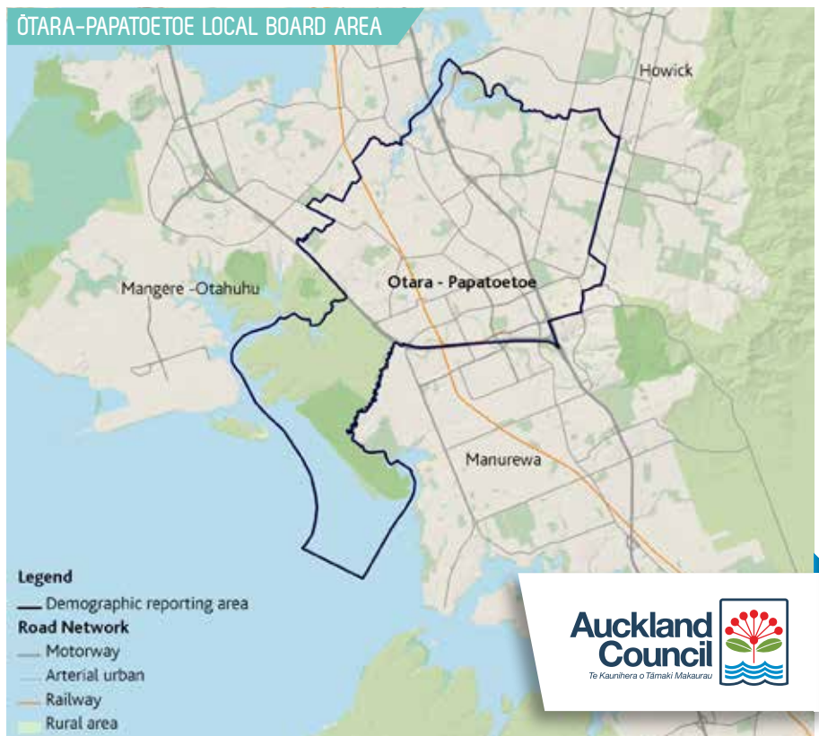
ŌTARA-PAPATOETOE LOCAL BOARD AREA

4,877 BUSINESSES IN THE LOCAL BOARD AREA (2013)